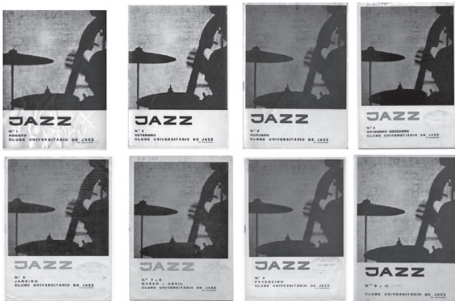
Figure 5. Jazz 's covers 23