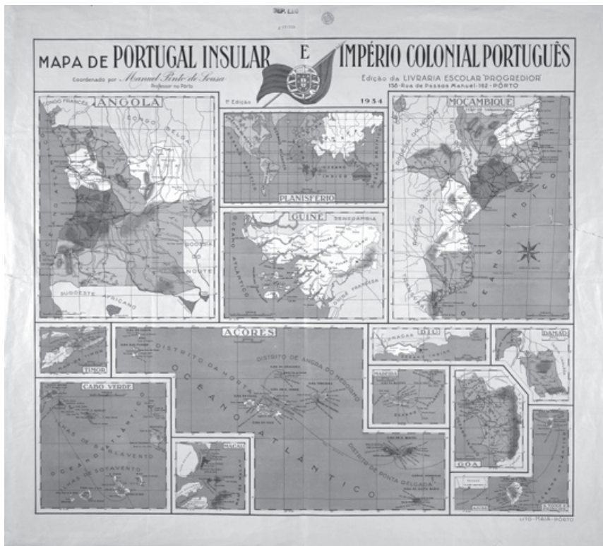
Figure 1. "Império Colonial Português" 7

During the 1950s, Portuguese society went through profound changes (Barreto 2000). Those changes of behaviour and mentality, described by Rosas as "invisible changes", took place during the Cold War in a context of political and social domestic repression, and isolation of the country from the rest of the world. In part, synthesised metaphorically by the Portuguese dictator António de Oliveira Salazar's motto, "proudly alone" (Rosas, 2001, p. 1051). Simultaneously, the world already witnessed an increasing movement towards decolonisation. Portugal was one of the last European colonial empires ruling several colonies in Africa, Asia and Oceania (see figure 1). 6